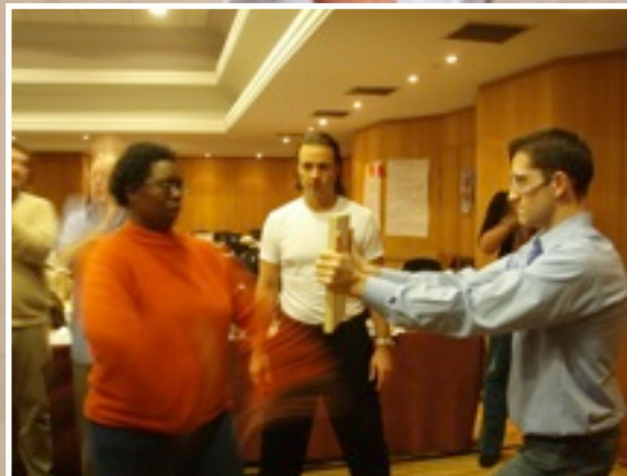
WORLD CLASS TRAINING